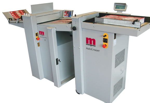
Picture shows AutoFold Pro with Morgana AutoCreaser

The beauty of the AutoFold Pro is its simplicity allowing the user of ANY manufacturer's creaser to invest in one and to improve their productivity and quality immediately.